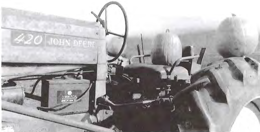
The Bolinas pumpkin patch tractor.