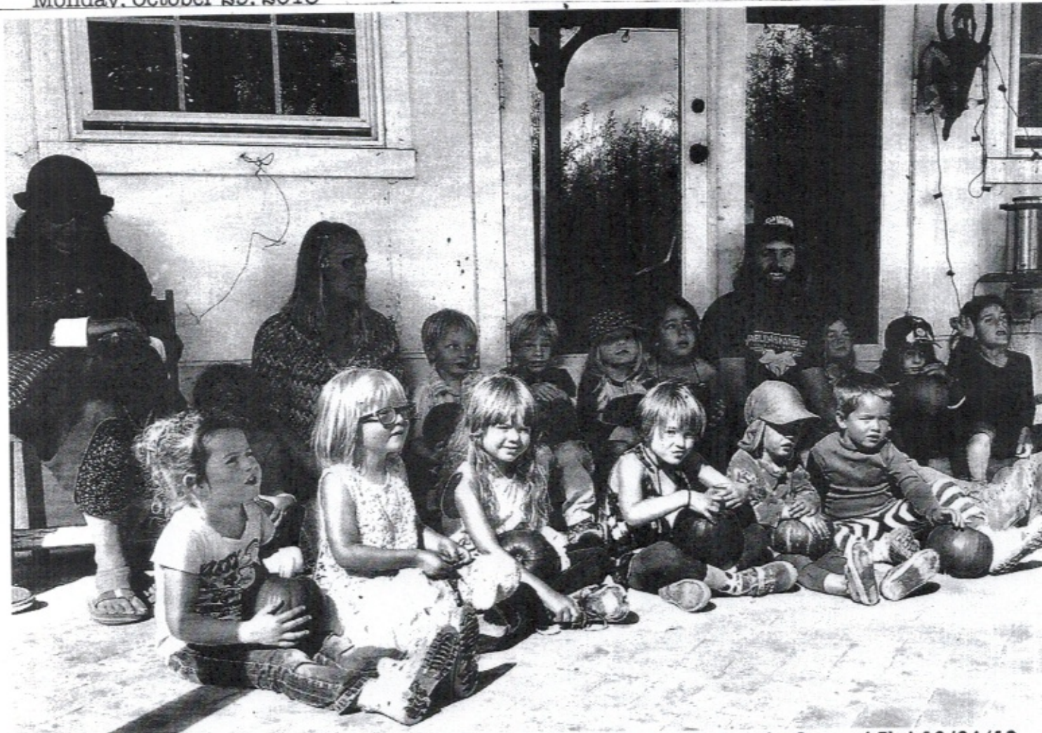
The Stinson Beach Preschool Field Trip to Mickey's Pumpkin Patch, Gospel Flat 10/26/18