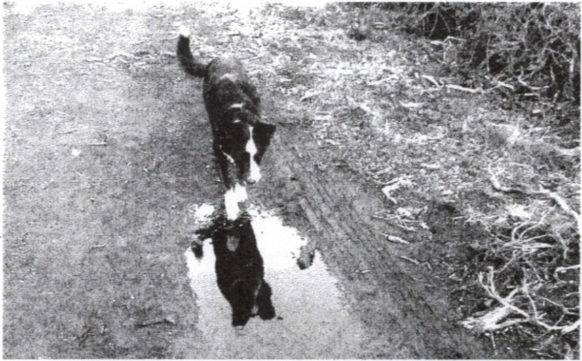
PUDDLE, PUDDLE on the path ~ who's the fairest .... Panda at Commonweal.