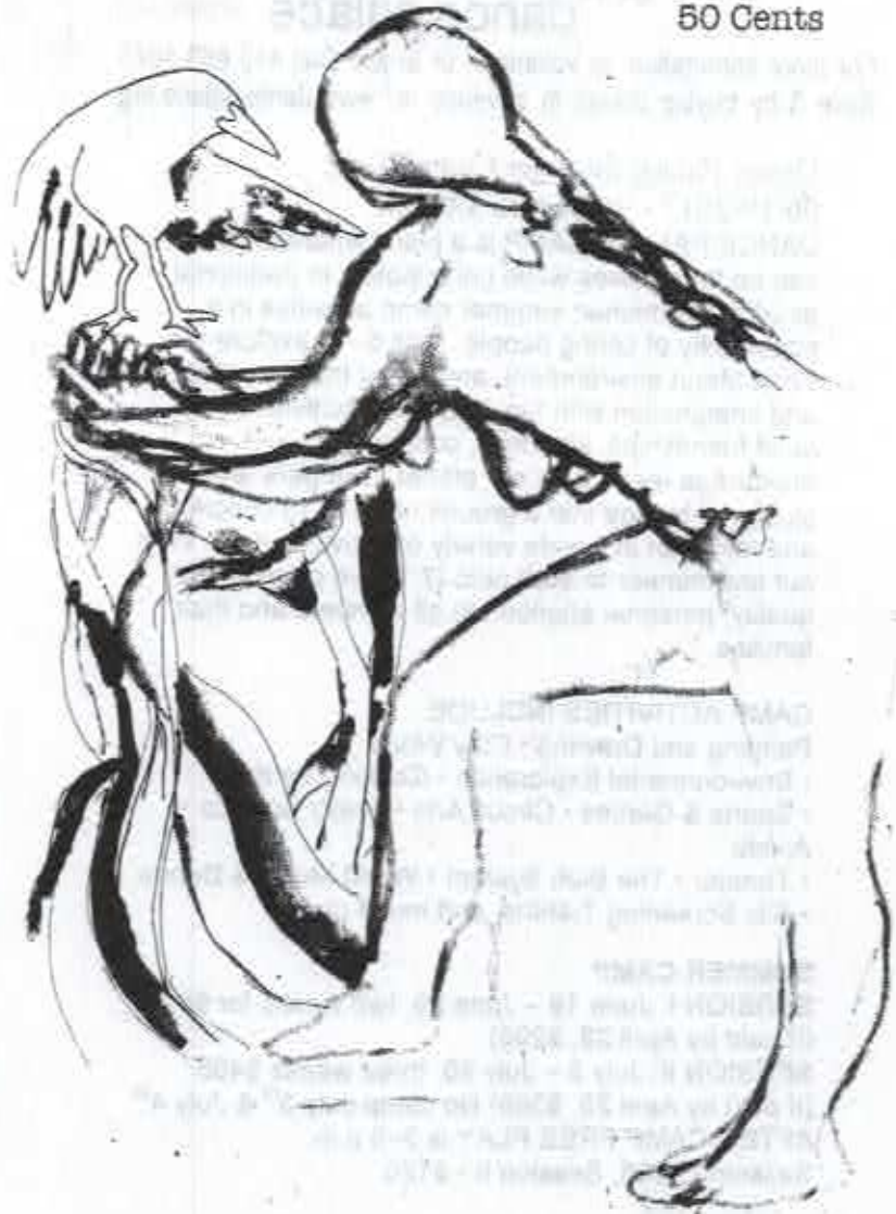
By Kale Likover