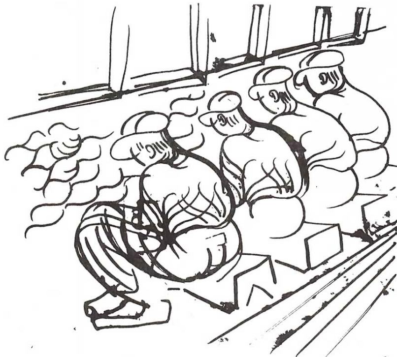
Reproduction of an Original Ink Drawing by Walter Inglis Anderson (1903-1965)