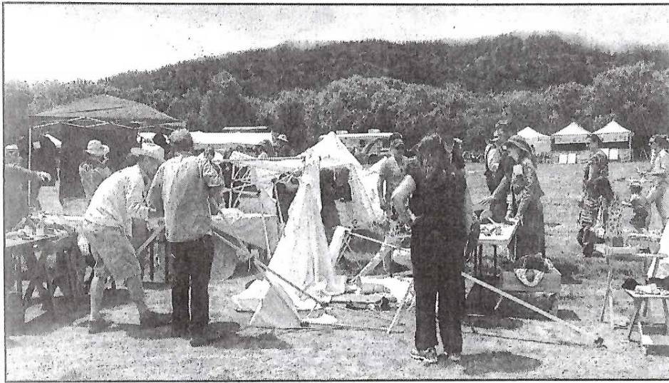
Three vendors' tents were wrecked by the powerful dust devil.