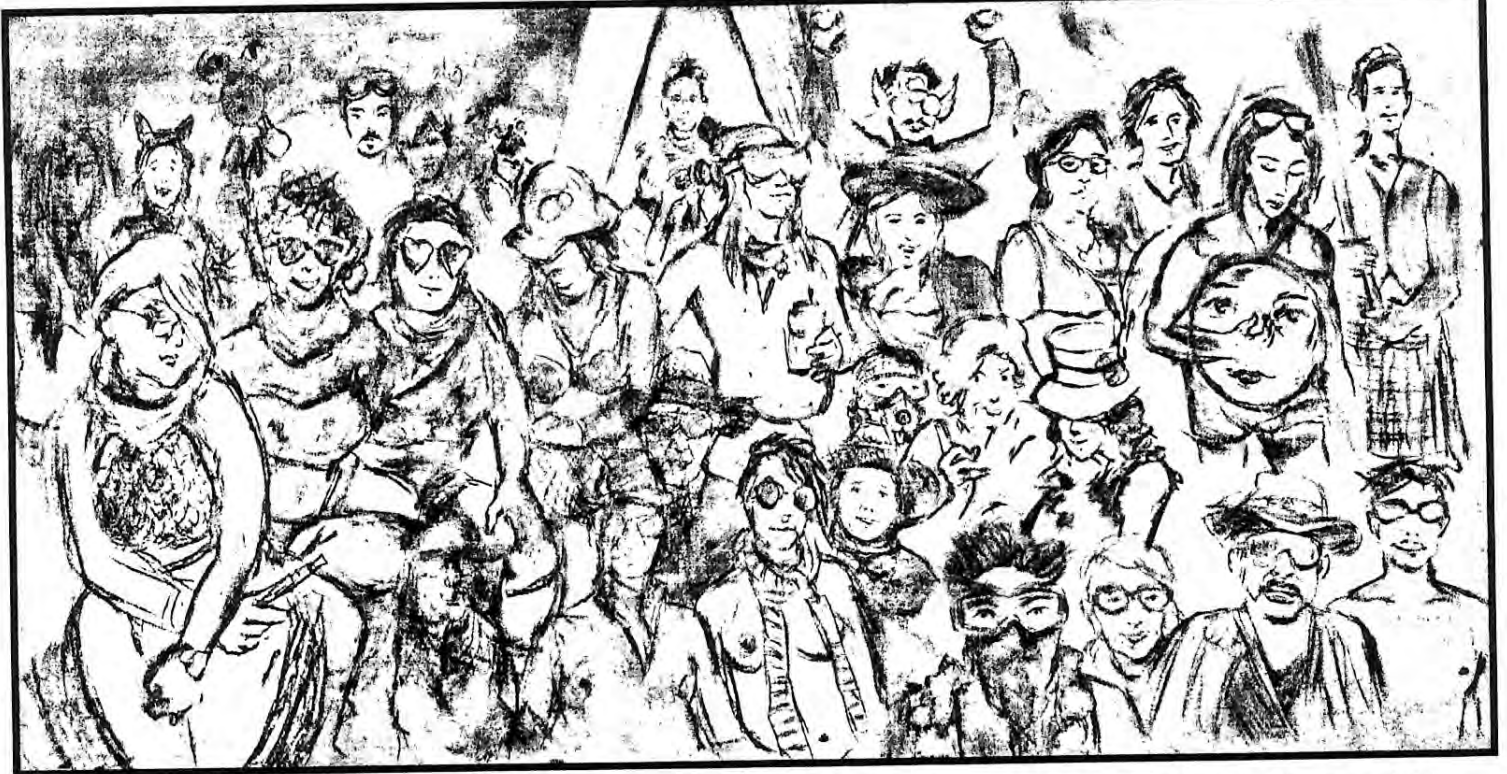
Burning Man Charcoal Mural - I thought it might be "fun" to sketch Burners in charcoal. For a couple of days I set up a wooden panel on an improvised easel in the Souk near the Wheel of Life. I put anyone who asked into the mural. The more I sketched the better I got but it was still a challenge every time. — StuArt